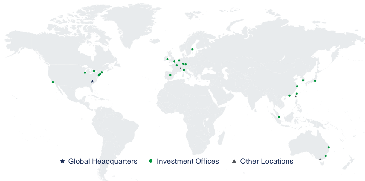
External AUM by Region 1

Barings, a subsidiary of MassMutual, is a global investment manager sourcing differentiated opportunities and building portfolios across public and private fixed income, real estate and specialist equity markets.