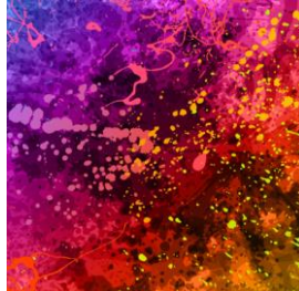
Out & Allies